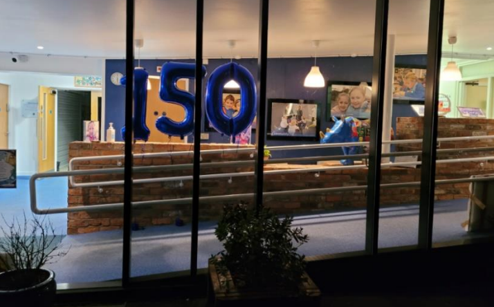
We enjoyed celebrating our birthday together!