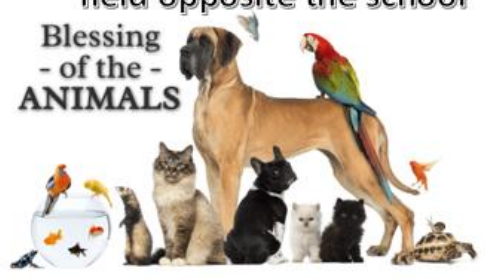
PLEASE BRING YOUR PETS AND DOMESTIC ANIMALS TO BE BLESSED